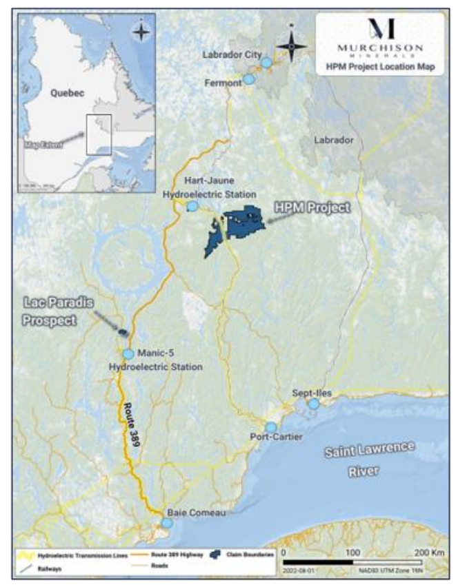
Figure 1: Location map of the HPM Project, located approximately 220 km North of Sept-Iles, QC. .