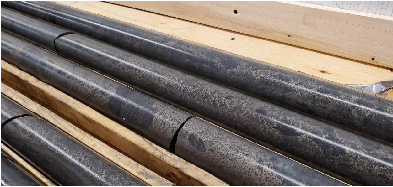
Figure 2: Semi-massive and breccia pyrrhotite mineralization observed in hole PYC21-001