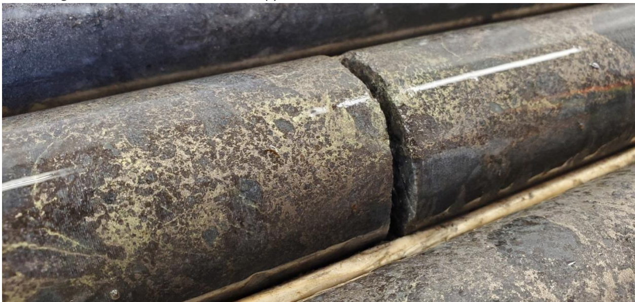
Figure 3: Close-up of pyrrhotite and chalcopyrite mineralization within hole PYC21-001.